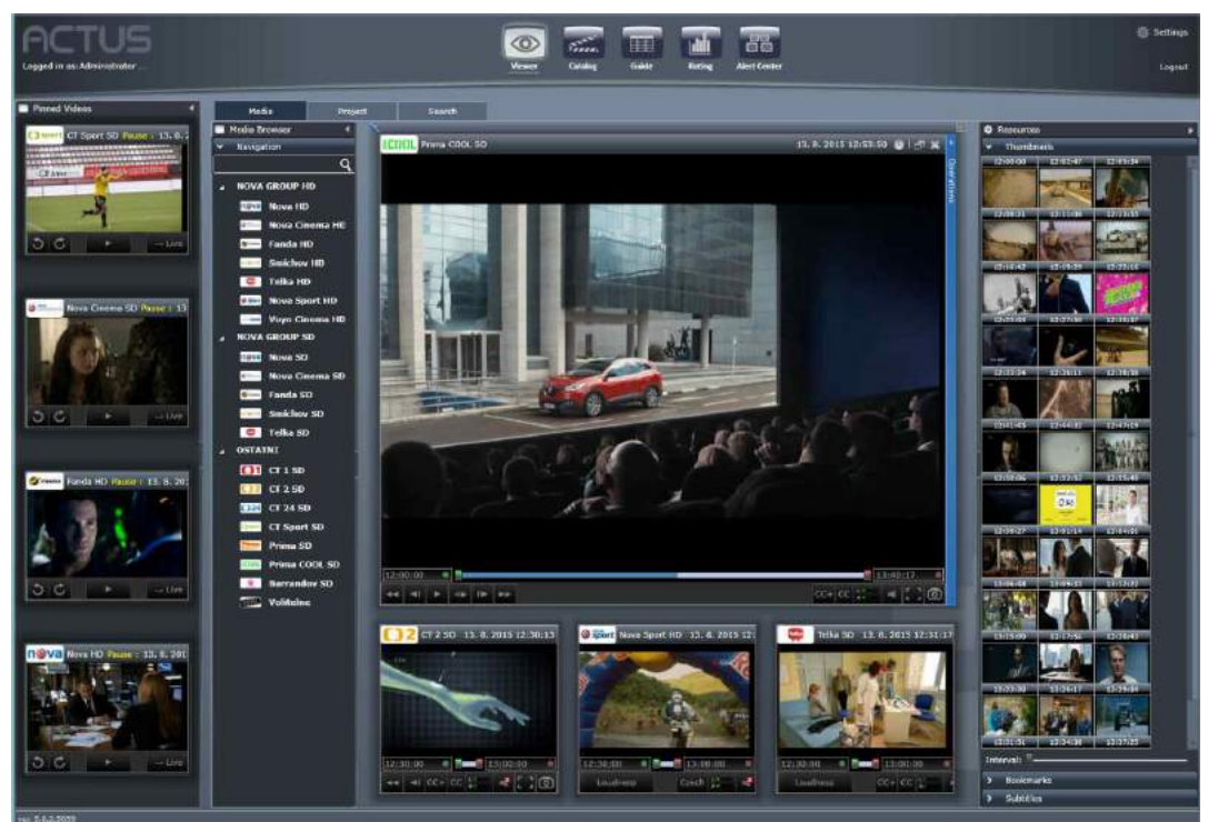
Actus View: Multiple video players allow live and archived video in any combination