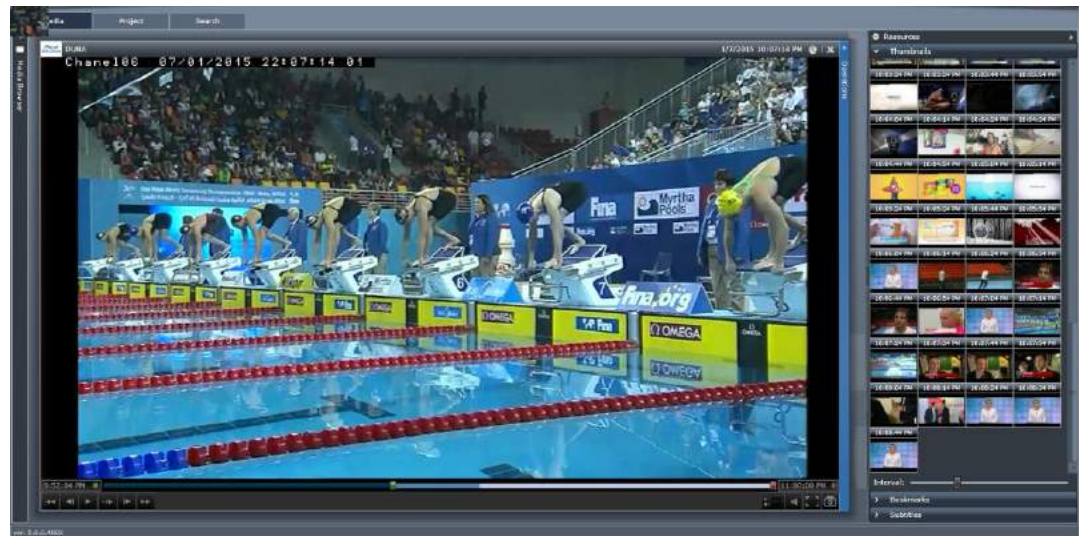
Actus View: Video player and storyboard for easy navigation