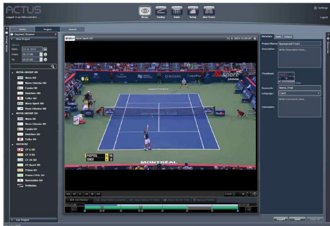
Actus Clip Factory: Multiple segment clips, metadata